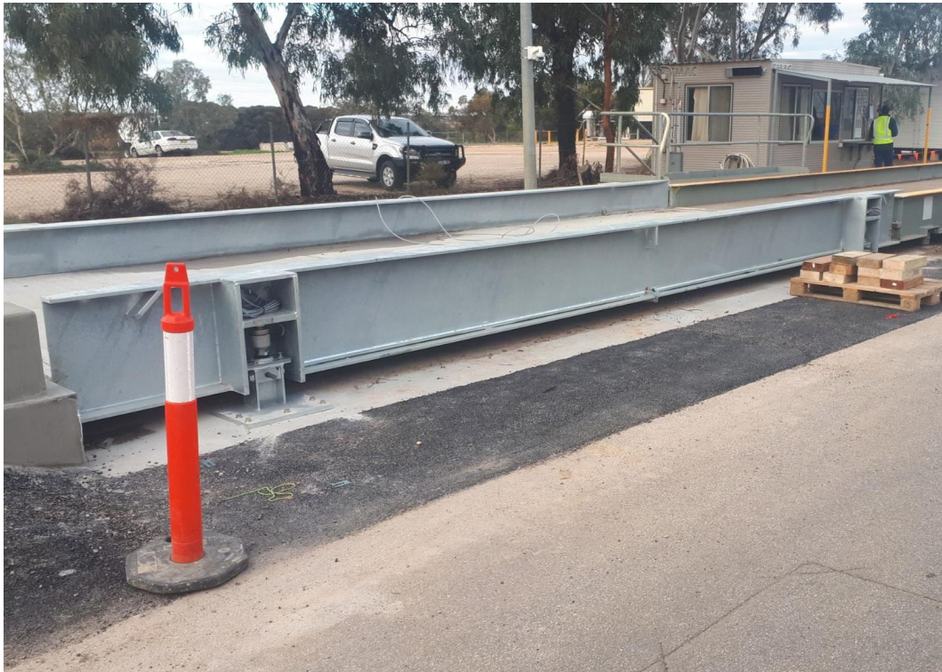
Bilanciali Model SBP/C Titan I-Beam Instrument (Variant 3)